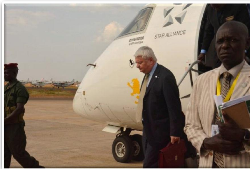
Herve Ladsous arriving at Juba International Airport 2 February, 2014