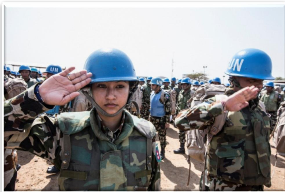
Military reinforcements from Nepal include 10 female troops