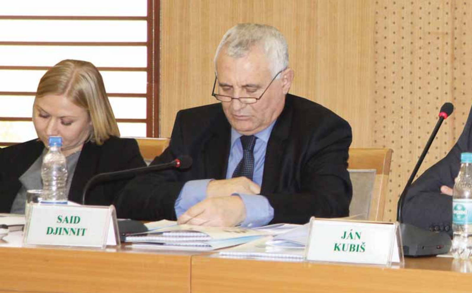
At the working session of the Conference MFA of Turkmenistan, Ashgabat