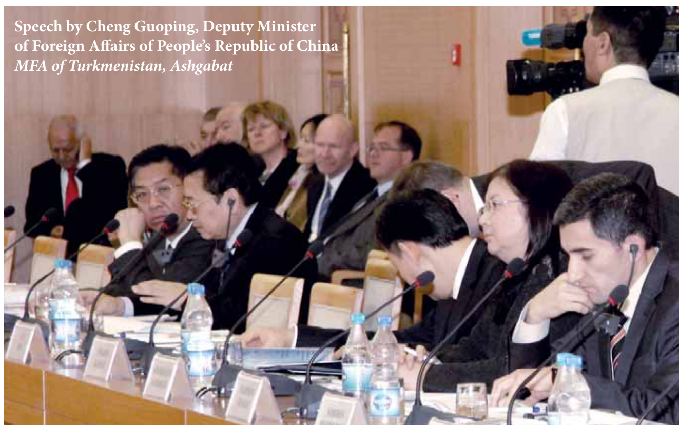
Speech by Cheng Guoping, Deputy Minister of Foreign Affairs of People's Republic of China MFA of Turkmenistan, Ashgabat

On the Centre's initiative, such mechanisms as the forum of Deputy Ministers of Foreign Affairs of the Central Asian countries, regular meetings of the ambassadors of the Central Asian countries and a mechanism of cooperation among the leading think tanks of the countries of the region have been created, which are helping reinforce and promote harmonious coexistence among the countries of the region. By adhering to a policy of aiding peace and cooperation, the Centre has been actively responding to regime changes, inter-ethnic conflicts, border disputes and other exceptional events in the region. Good cooperation is maintained between the Centre and the SCO, CIS and other regional organisations with the aim of aiding development and regional integration. The Centre focuses great attention on environmental degradation in Central Asia and the drying up of the Aral Sea, drawing up constructive recommendations for the Governments of the region to solve these problems. In close cooperation with the UN Assistance Mission in Afghanistan, the Centre has made great strides in aiding the stabilisation of the situation in Afghanistan, regularly reporting to the UN Secretary-General on countering threats and developing cooperation in Central Asia. Thanks to its practical and effective activities, the Centre has won universal recognition and the appreciation of the international community.