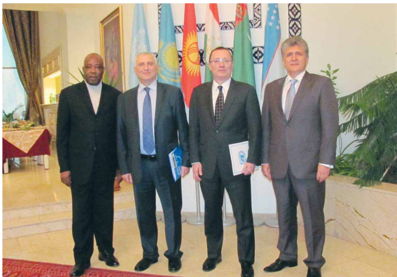
Meeting of Under-Secretary-General of the United Nations and Special Representatives of the Secretary-General

- Expectations vs. resources: This gap between expectations and resources is not new. However, these Regional Offices are mandated to cover a vast region with UNOCA mandated to cover ten countries, UNOWA to cover 16 and UNRCCA to cover five, while they are among the smallest field-based SPMs. In such contexts, the SRSGs emphasized the importance of periodically reprioritizing their engagement.