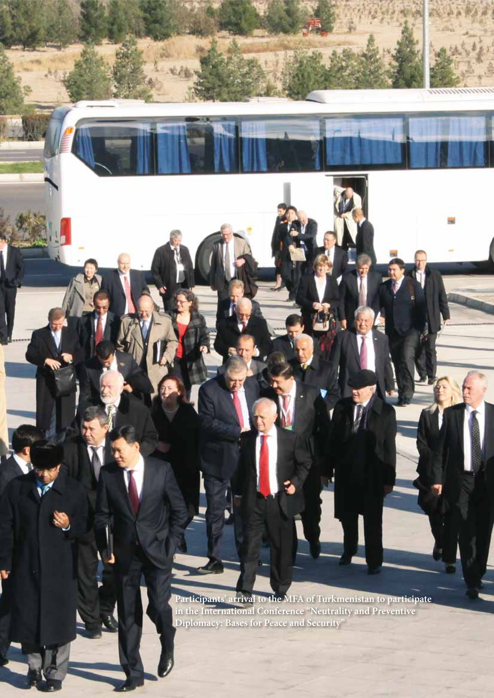
Participants' arrival to the MFA of Turkmenistan to participate in the International Conference "Neutrality and Preventive Diplomacy: Bases for Peace and Security"