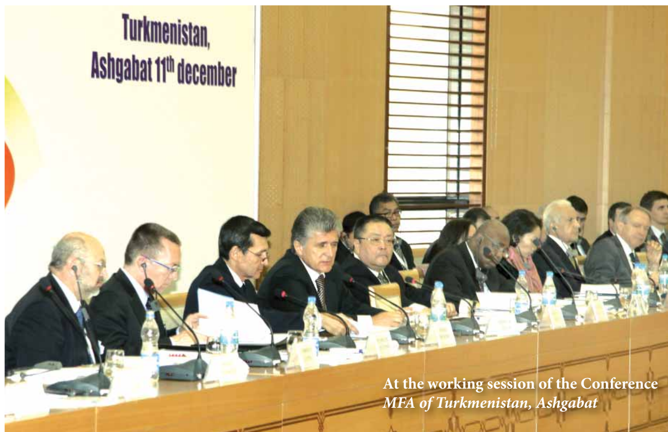
At the working session of the Conference MFA of Turkmenistan, Ashgabat

To discuss such existing and potential threats, we convened the fourth annual meeting of Central Asian Deputy Ministers of Foreign Affairs in Bishkek in October this year. One of the key messages coming out of that meeting was the need for political will amongst the governments of the region to engage in a meaningful bilateral and/or multilateral dialogue. The governments of Central Asia demonstrated such political will when the Regional Centre was established. I believe that our efforts to increase trust between