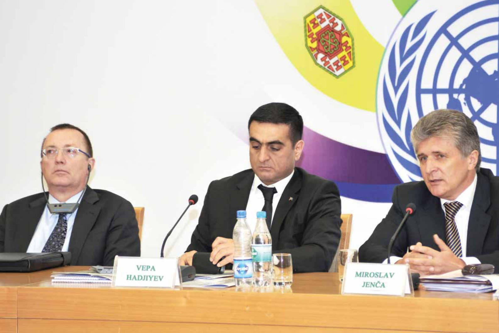
At the working session of the Conference MFA of Turkmenistan, Ashgabat