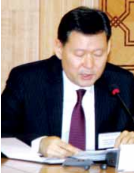
Kairat UMAROV Deputy Minister of Foreign Affairs Kazakhstan