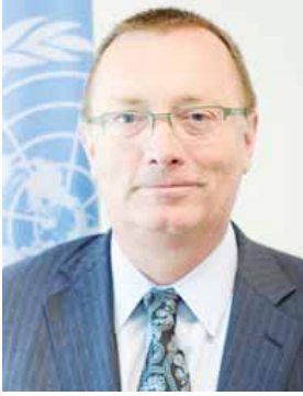
Jeffrey FELTMAN Under-Secretary-General for Political Affairs United Nations