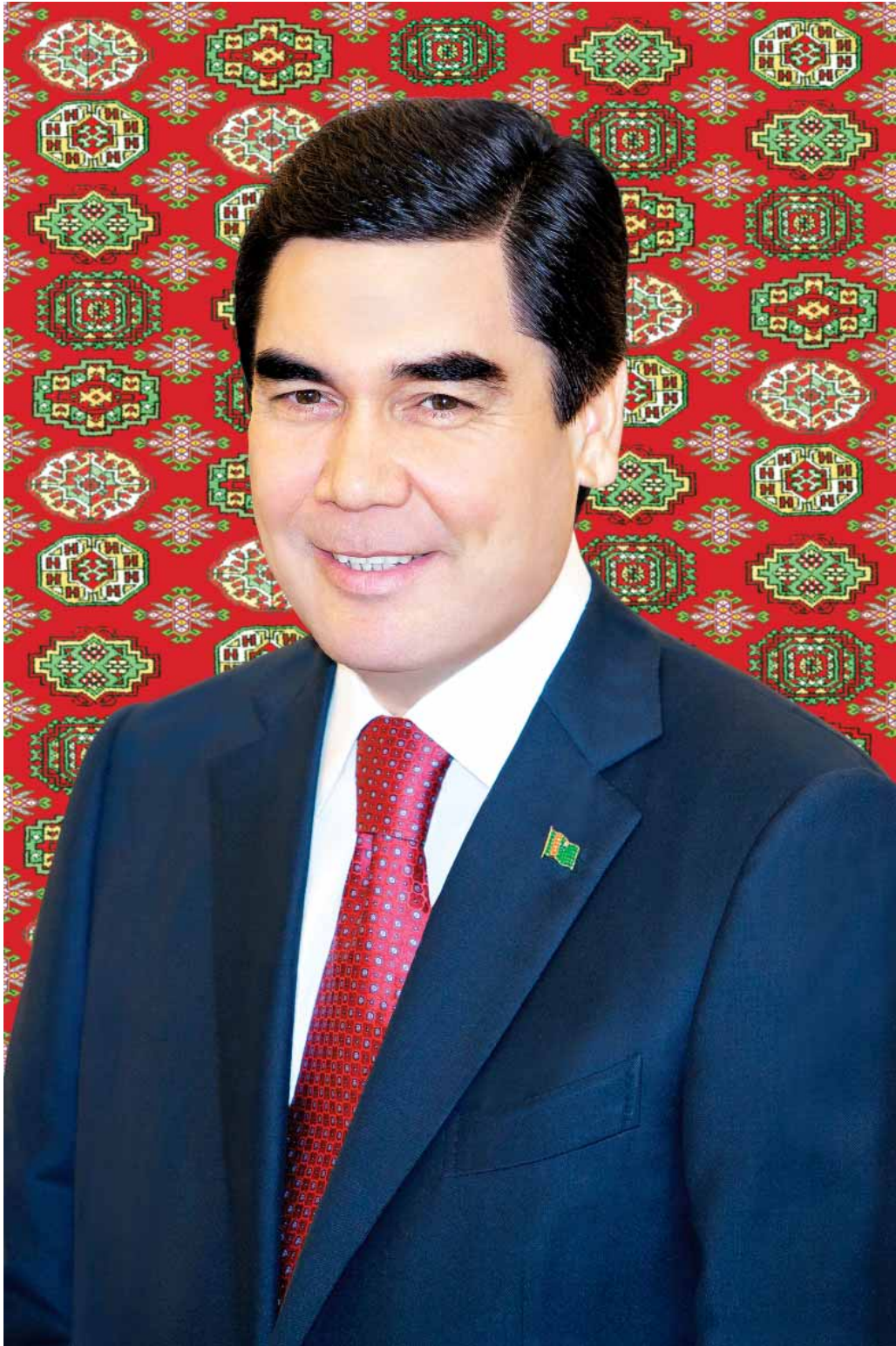
GURBANGULY BERDIMUHAMEDOV, PRESIDENT OF TURKMENISTAN