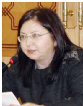
Samargul ADAMKULOVA Deputy Minister of Foreign Affairs Kyrgyz Republic