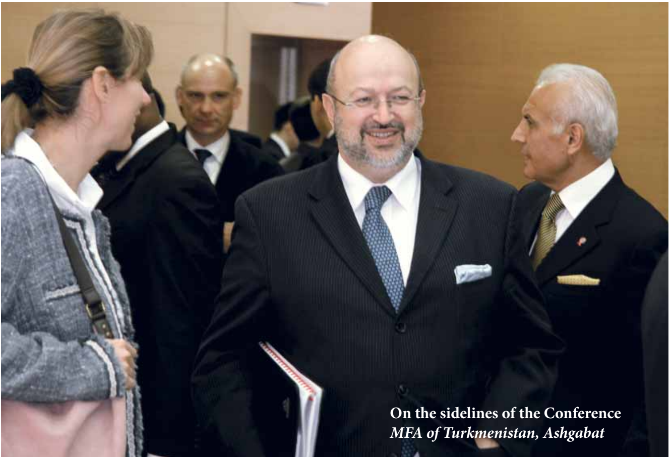
On the sidelines of the Conference MFA of Turkmenistan, Ashgabat

Asian States. A CTITF Joint Plan of Action for Central Asia was adopted by a high-level meeting on 30 November 2011, here in Ashgabat. I can only reiterate the readiness of the OSCE to further support and contribute to this important process.