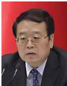
CHENG Guoping Deputy Minister of Foreign Affairs People's Republic of China