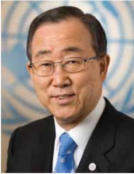
BAN Ki-moon Secretary-General United Nations