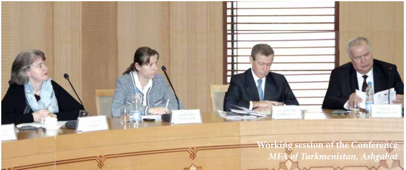
Working session of the Conference MFA of Turkmenistan, Ashgabat

Among the challenges and threats present in the past 20 years not only in the Central Asian region but throughout the world include, above all, the increasing scarcity of water resources, the deterioration of their quality and the environmental troubles that have afflicted many regions of the planet. Therefore, the visit of UN Secretary-General Ban Ki-moon to the Central Asian countries in April 2010 emphasized that the UN is placing top priority on issues of the Central Asian countries' development and is ready to assist in resolving the current problems of the region. Among the important issues raised during the visit were the problems of the Aral Sea basin. It is encouraging to note that the UN Secretary General expressed support for IFAS as a five-party political regional organization and for the activities of the Executive Committee of IFAS in his speeches in all of the Central Asian countries. Such a positive assessment of our efforts to overcome the Aral basin crisis has been a significant boost to further joint work.