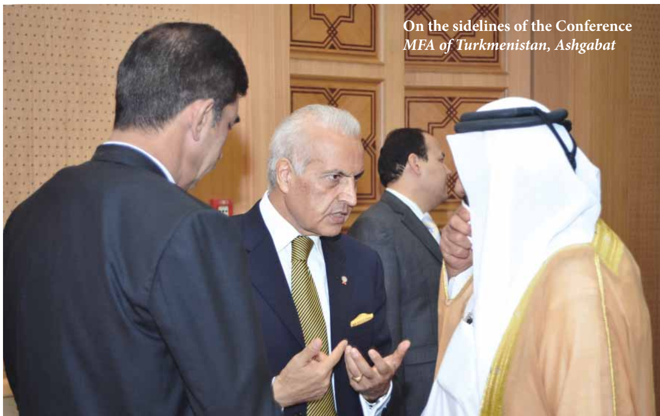
On the sidelines of the Conference MFA of Turkmenistan, Ashgabat

Let me also highlight and praise the traditional policy of the Government of Turkmenistan to offer good will and be part of those who provide solutions to the challenges that our World faces nowadays. The World community witnessed Turkmenistan's tireless efforts under the leadership of its esteemed President, H.E. Gurbanguly Berdimuhamedov, in bringing in May 2012, decision makers of Muslim countries as well as other partner States, international entities and non-governmental organizations to discuss and propose solutions to the never ending refugee situation in the Muslim World. The Ashgabat Declaration