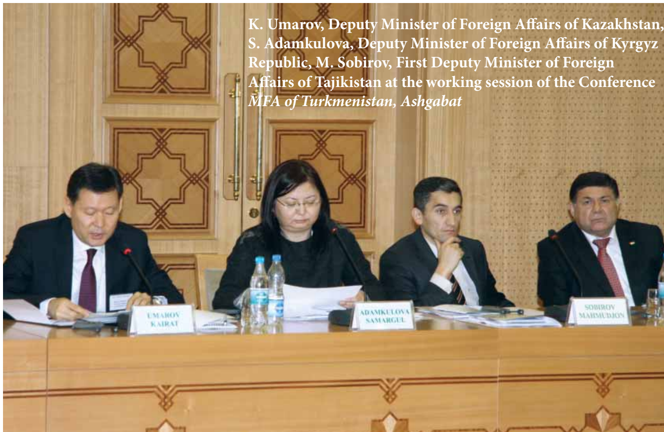
K. Umarov, Deputy Minister of Foreign Affairs of Kazakhstan, S. Adamkulova, Deputy Minister of Foreign Affairs of Kyrgyz Republic, M. Sobirov, First Deputy Minister of Foreign Affairs of Tajikistan at the working session of the Conference MFA of Turkmenistan, Ashgabat

development of Central Asia, having initiated a host of important, large-scale projects of international significance.