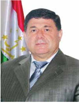
Makhmudzon SOBIROV First Deputy Minister of Foreign Affairs Tajikistan