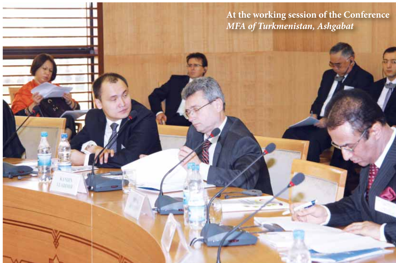
At the working session of the Conference MFA of Turkmenistan, Ashgabat

The vision we have for Afghanistan is not just to have a better, safer and more prosperous country for the Afghans, but also to be a friendly, constructive and dependable partner for the region. Without the region's goodwill, support and contributions, Afghanistan would not have been able to make the transition toward a successful decade of transformation. We know that, while our friends and partners will come