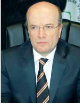
Naci KORU Deputy Minister of Foreign Affairs Turkey