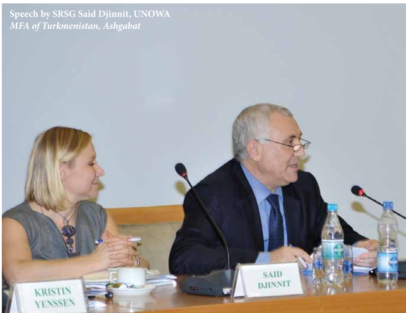
Speech by SRSG Said Djinnit, UNOWA MFA of Turkmenistan, Ashgabat

Guinea is a key example that demonstrates the different roles that a regional office can play and how these articulate with our partners. From the period 2009-2010, UNOWA worked with regional actors following