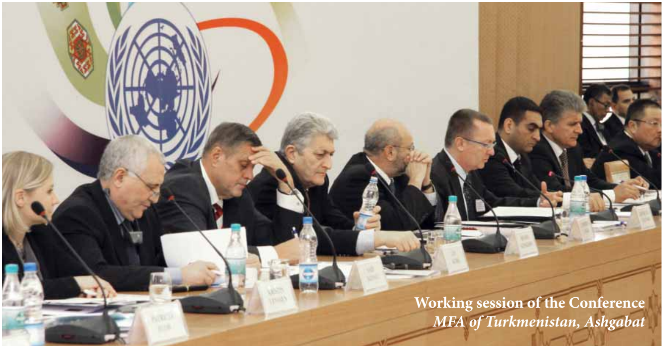
Working session of the Conference MFA of Turkmenistan, Ashgabat

We would like to express our particular gratitude to Turkmenistan's leadership and to the highly respected Gurbanguly Mialikgulievich Berdimuhamedov personally for the fact that this productive chairmanship has resulted in the adoption of a number of documents that are fundamentally to the further expansion of interstate cooperation.