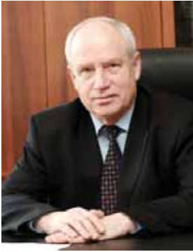
Sergei LEBEDEV Executive Secretary Commonwealth of Independent States