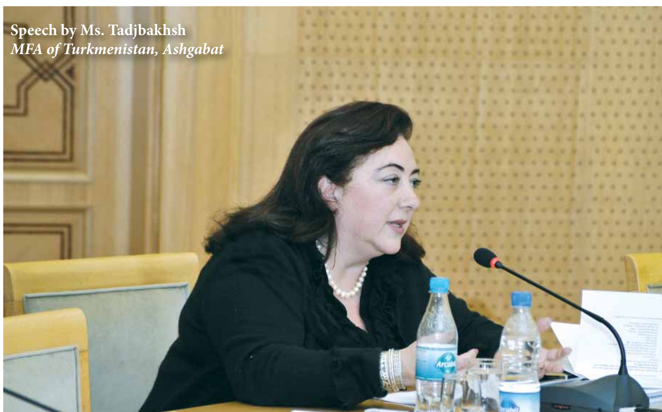
Speech by Ms. Tadjbakhsh MFA of Turkmenistan, Ashgabat

It would be farfetched to claim that diplomacy can directly prevent terrorism, but the fifth anniversary of UNRCCA is a good occasion to highlight ways in which the Centre has been able to add value by going beyond traditional diplomacy or mediation between two States to adjusting old and new instruments to deal with new types of threats. Let me typologize the Centre’s interventions in five areas, using the CT portfolio as example.