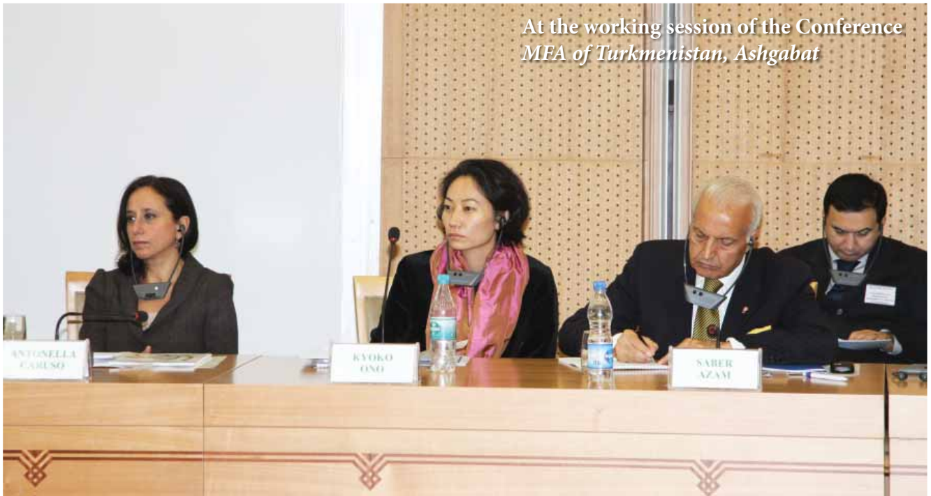
At the working session of the Conference MFA of Turkmenistan, Ashgabat

of Mutually Beneficial Multilateral Water Agreements in Central Asia’, held in Almaty in April 2009, and the training session on ‘International Legal Instruments on Trans-boundary Water Management’, held in Ashgabat in December 2011. Counter-terrorism is another issue that has received considerable attention; meetings on this topic have included a series of expert meetings on the implementation of the UN Global Counterterrorism Strategy in Central Asia. Other themes have included regional economic cooperation (linked to the UN Special Programme for the Economies of Central Asia) and regional security and peace-building initiatives (for example, the seminar on ‘Sustainable development: A key factor for stability and peace in Central Asia’, held in Tashkent in March 2012).